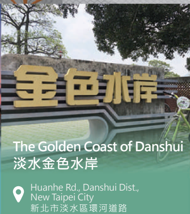
The Golden Coast of Danshui 淡水金色水岸

No. 199, Guanhai Rd., Danshui Dist., New Taipei City 新北市淡水區觀海路199號