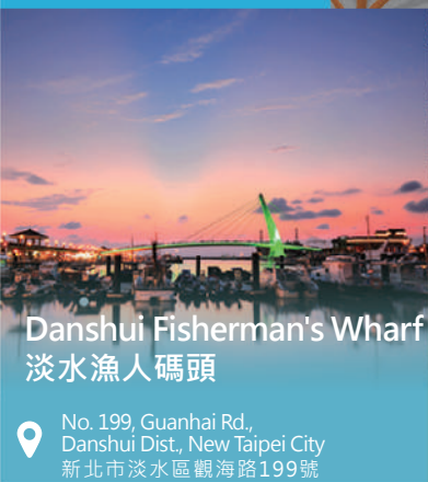
Danshui Fisherman's Wharf 淡水漁人碼頭

No. 199, Guanhai Rd., Danshui Dist., New Taipei City 新北市淡水區觀海路199號