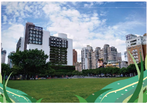
Park Lane by CMP