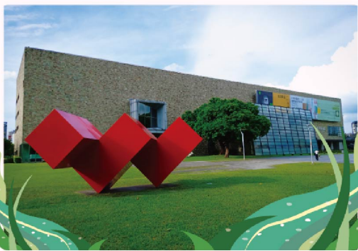
National Taiwan Museum of Fine Arts